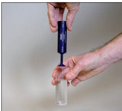
2. Orient SampleSizer for desired test volume: an arrow indicates the skinny end goes first for a 25 mL sample.