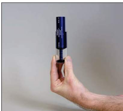
5. Tool should touch bottom.