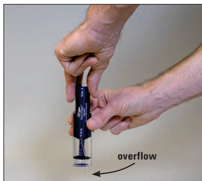
4. ...all excess water will be displaced.