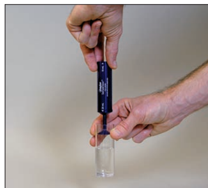
6. Carefully remove SampleSizer to avoid dragging out remaining water. Voilà!