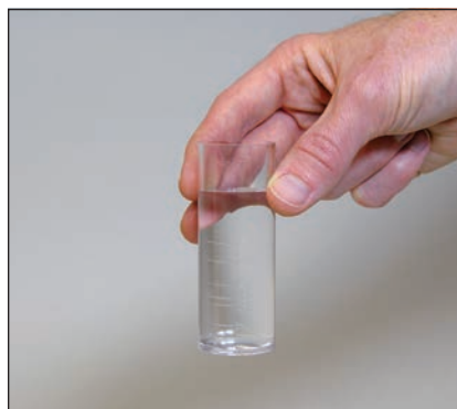
1. Rinse and fill #9198 sample tube with water to be tested in excess of desired volume.