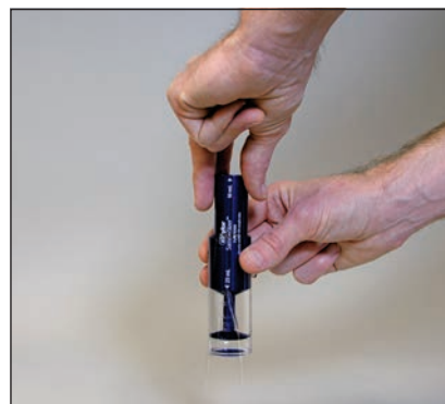
3. Slowly lower the tool into the sample...